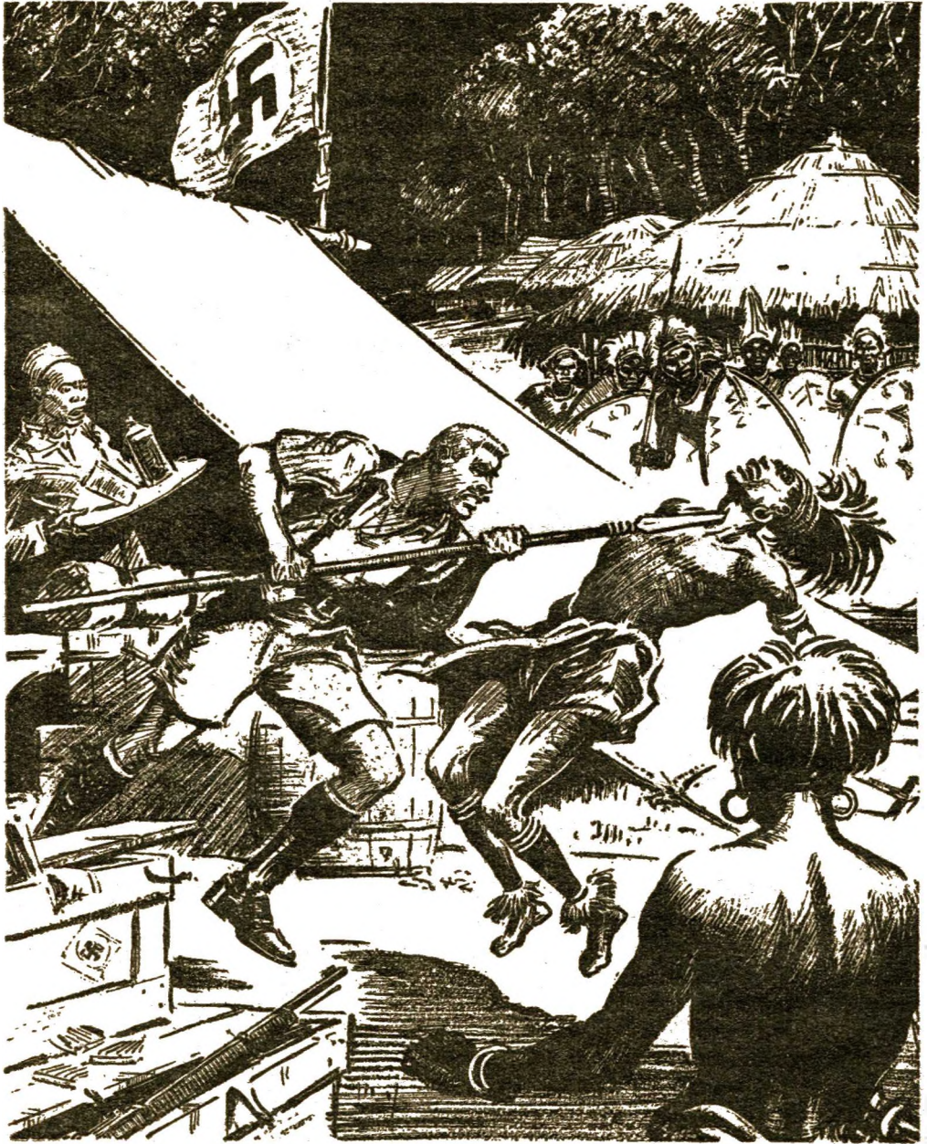
The German drove the broad blade forward.

Von Hagen had been a white god; but his son was a black devil who carried a crooked juju that N'tama could not fight—for if he fought, the juju would slay the people he loved.