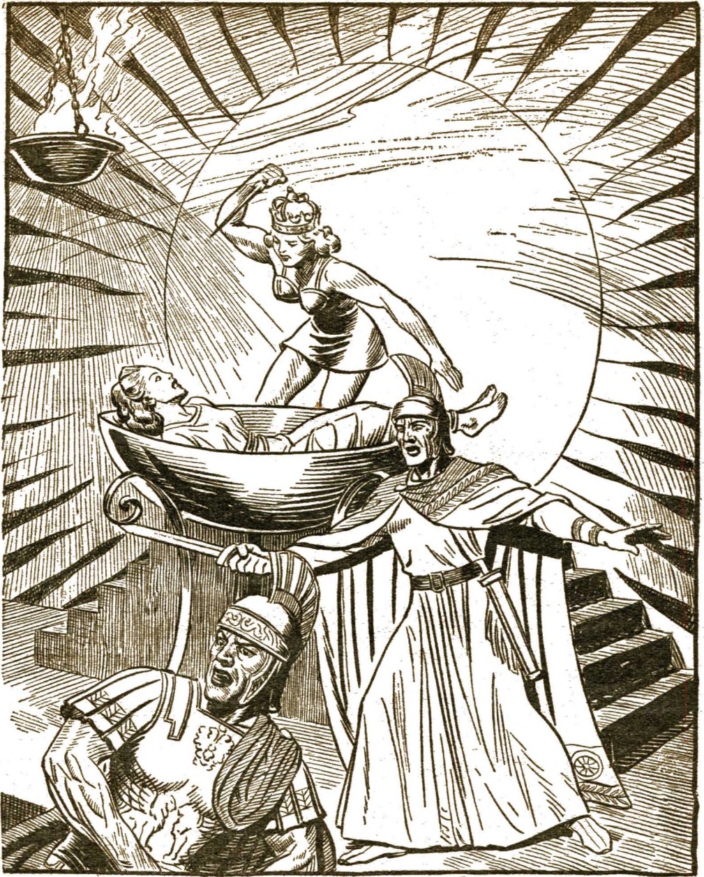
Derry Stone plunged toward the altar—and the knife slashed down!

D ERRY STONE came through the door into the shadows of the room, and his shoulders were wide against the sunlight. He stood silently for a moment, then strode lithely to the tables at the rear. Behind him, an Igotr pygmy squatted patiently outside the doorway, polished the length of a five-foot blowgun with a small calloused palm.