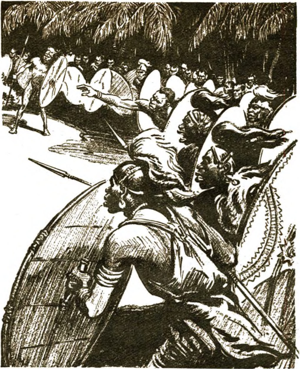
Grant Waring fired with a blind instinctive speed.

F OR THE very first time since he had been hired by Grant's father, Andouiah, the two hundred and fifty pound cook, had broiled the chops perfectly—not too raw, not too brown, just right. He had made also a savory moulouiah of vegetables. With some limes, crushed mangoes, rum and plenty of ice, he had prepared a cool pitcher of invigorating cocktails. But instead of enjoying his lunch, Grant kept on angrily mulling over the letter just brought in by a sepian jungle