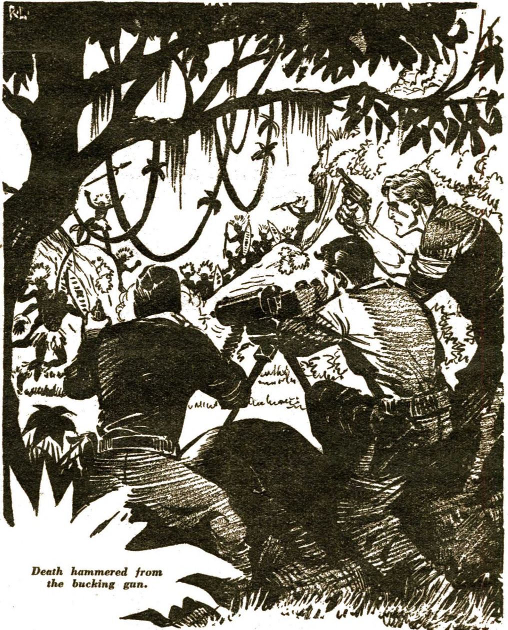
Death hammered from the bucking gun.

A Continuation of the Great Edgar Wallace Character "Sanders of the River"