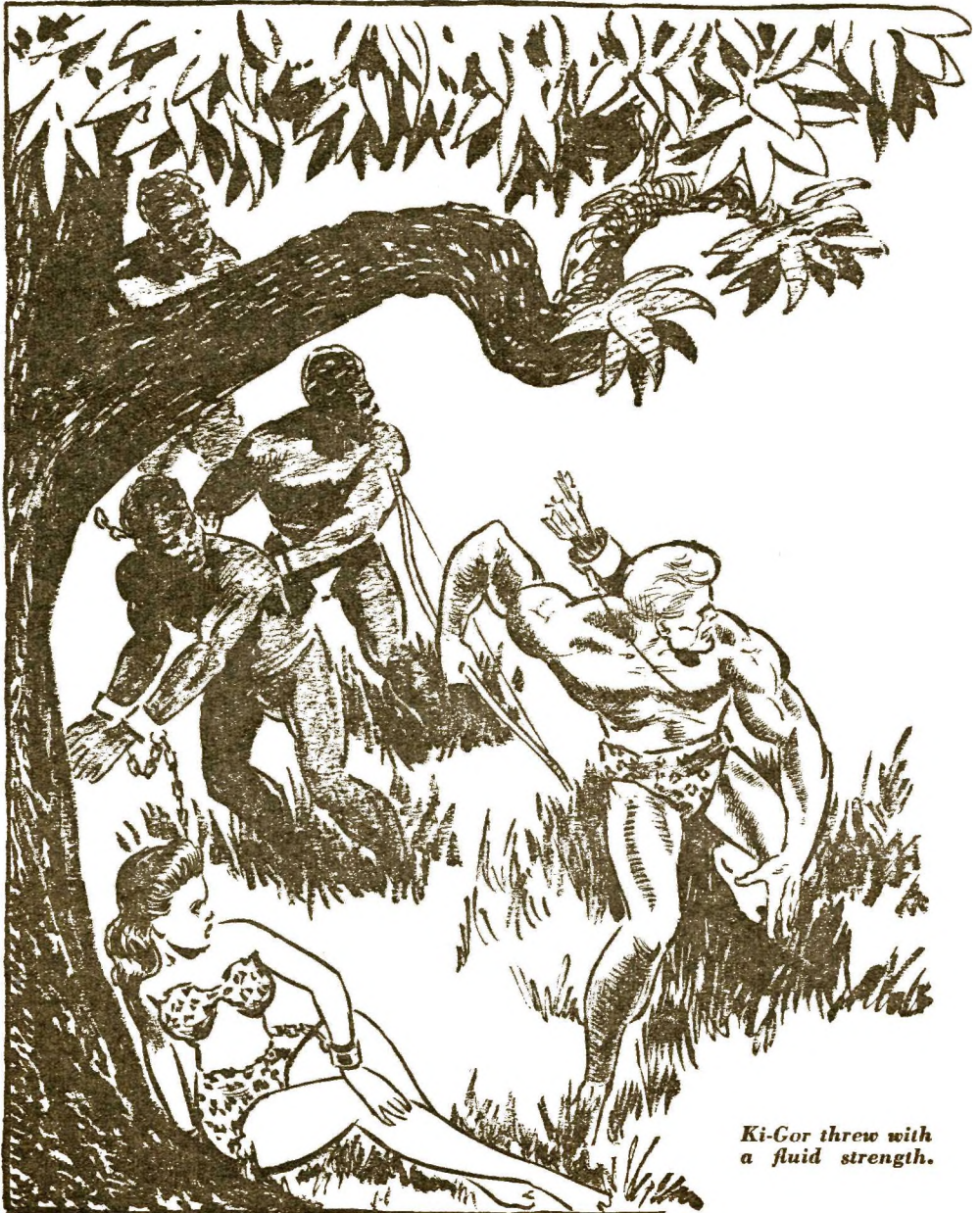
Ki-Gor threw with a fluid strength.